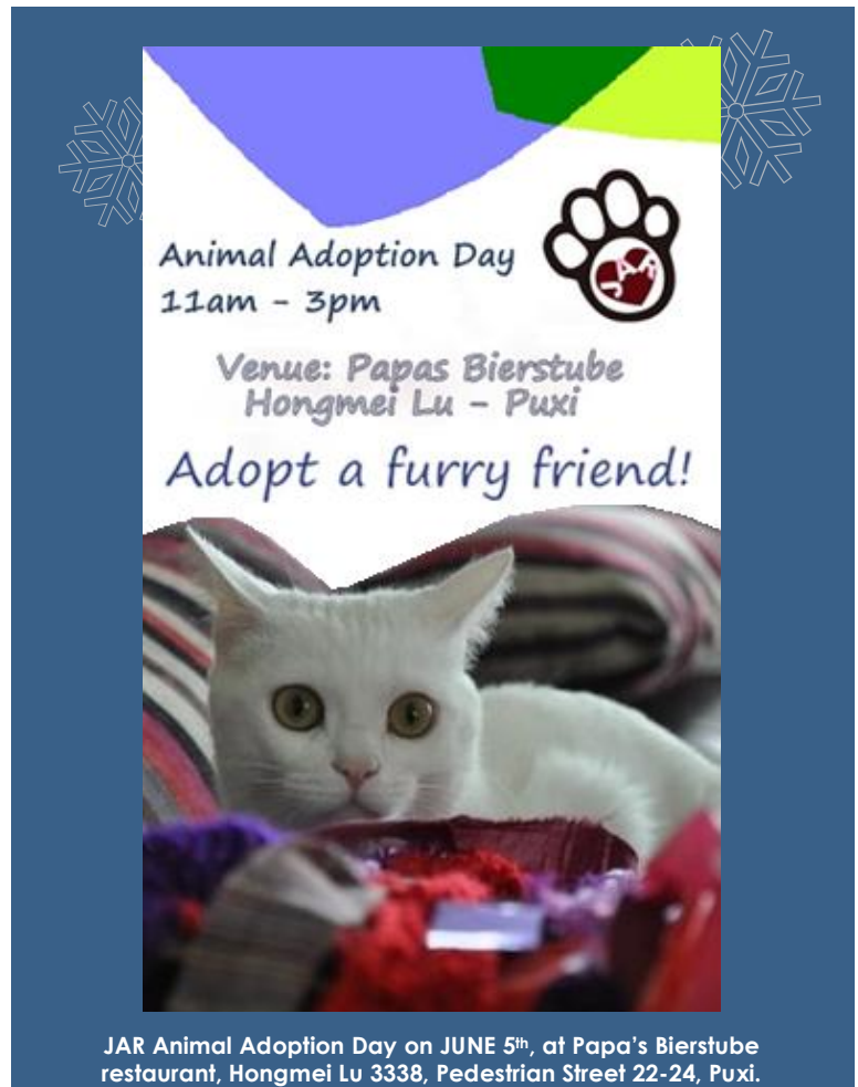
JAR Animal Adoption Day on JUNE 5 th , at Papa's Bierstube restaurant, Hongmei Lu 3338, Pedestrian Street 22-24, Puxi.