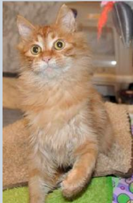
Chun Chun (top) and Liga (bottom)